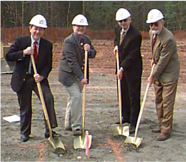
Groundbreaking ceremony of the NISS building in 1997.