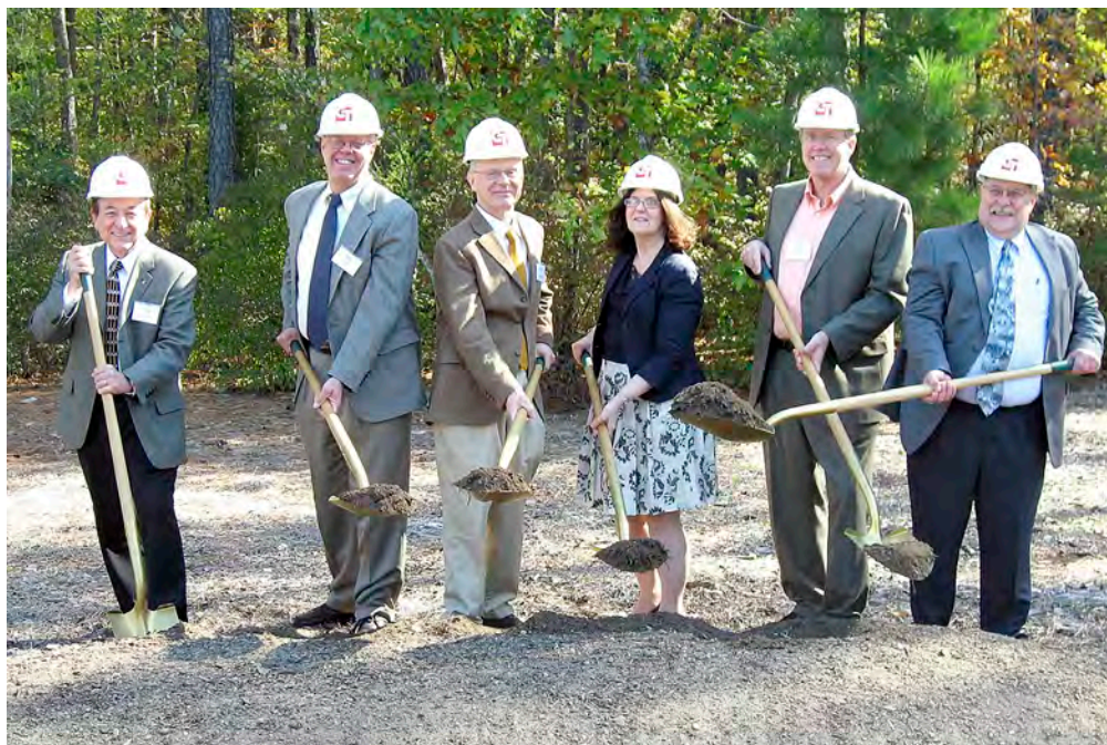
1997 Groundbreaking of the NISS building.